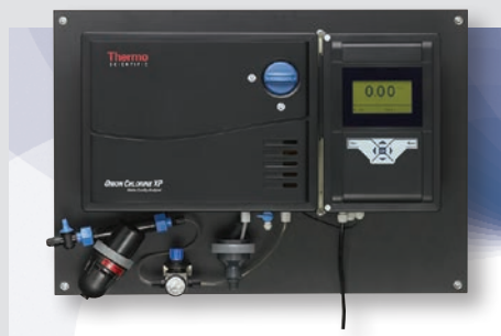
Thermo Scientific Orion Chlorine XP Online Water Quality Analyzer