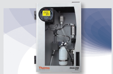
Thermo Scientific Orion 2117LL Low Level Chloride Analyzer