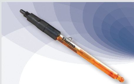
Thermo Scientific Orion 2001SC High Purity ROSS pH Electrode